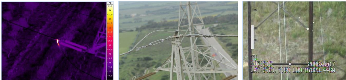
Data acquired from 3 sensors: IR, HD, UV

NOTE: the additional integrated sensors are per specific customers' requirements